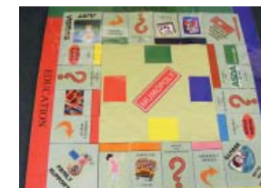
Monopoly game used in a parental responsibilities game at a community group for young mums

Students made 18 presentations to various local schools and community groups, on a range of different topics.