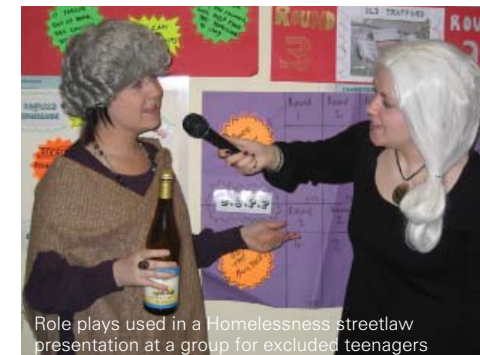
Role plays used in a Homelessness streetlaw presentation at a group for excluded teenagers

“Only upon volunteering do you realise the true value of the service.” Student Witness service